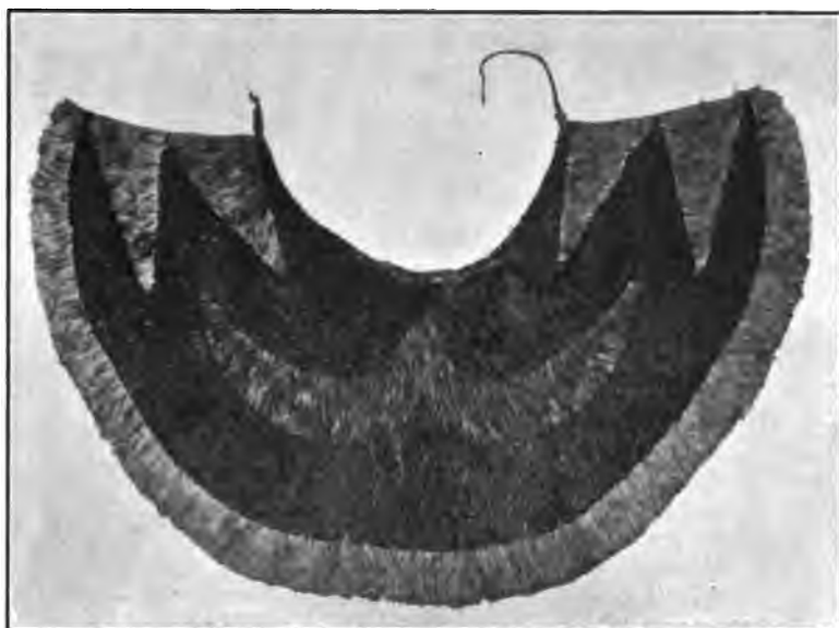
FIG. 14. CAPE AT NEWCASTLE-UPON-TYNE.

the design (Fig. 16) as well as the following measurements are from the description given to Mr. Walcott by Peleioholani and are of course only approximate. They are